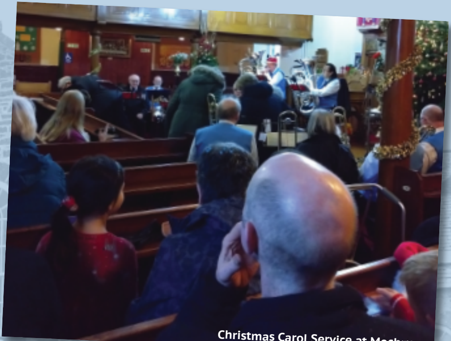
Christmas Carol Service at Mochrum