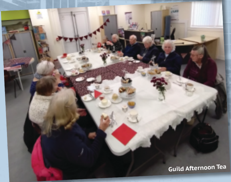
Guild Afternoon Tea