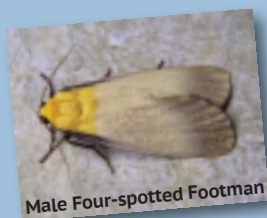
Male Four-spotted Footman

A few days later we found a male Four-spotted Footman Moth ( see photo ) on our car window early in the morning. At the Crook of Baldoon RSPB reserve on 14th of the month,